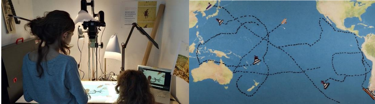
Left to right: Children's Film Studio animators at work on The Rescue Whale and a still from The Rescue Whale

Following on the wildlife theme, but with a very different approach, The Rescue Whale is a film made by the Children's Film Studio at the Entropia Gallery using stop motion animation technique. The film shows the impact increasingly polluted seas and oceans are having on wildlife and tells the story of the invention of a new floating water purifier, inspired by the ingenuity of marine wildlife.